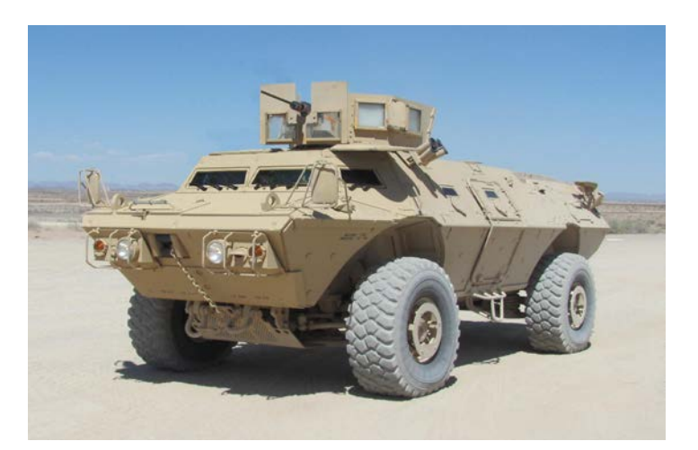
Figure 1. Mobile Strike Force Vehicle Armored Personnel Carrier

A military personnel carrier is shown in Figure 1[18]. This vehicle protects passengers by means of large amounts of metal that surround the passenger compartment. But each carrier costs $1.1 million, and even after deducting the cost of military equipment such as weaponry, the carrier costs far too much to be purchased for civilian use.