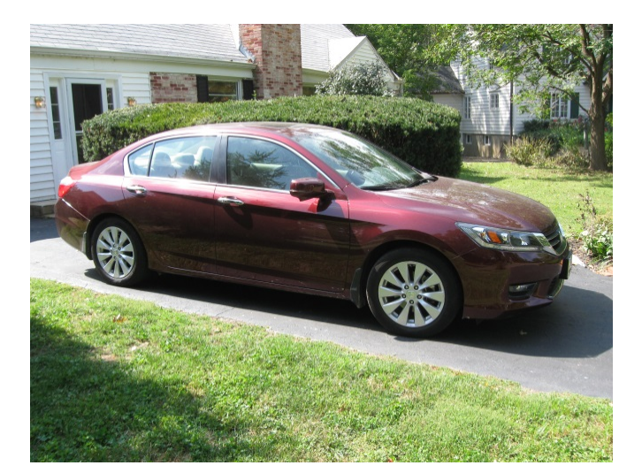
Figure 2. Honda Accord

Why does the public accept this trade-off? Because the public considers the typical passenger car to be an acceptable risk. Most members of the public do not know the actual odds of dying in a car accident—about 1 in 37,000 in a one-year period [20]—but nevertheless correctly judge that the risk to an individual is small. Given that the risk is acceptable and that other benefits beside lower cost are numerous—speed, comfort, convenience, fuel efficiency, appearance and lower cost, to name a few—the trade-off is readily accepted.